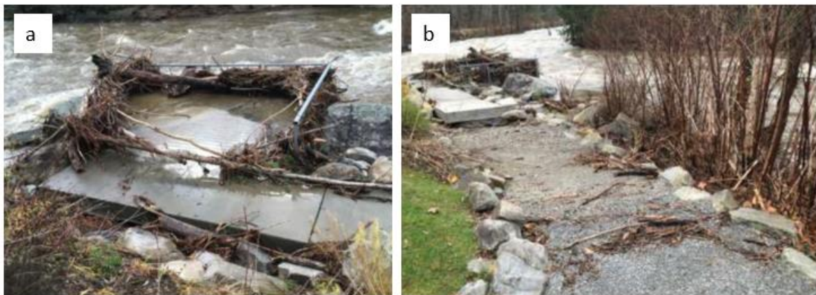
Figure 7. (a) Large woody debris was caught by the UFP railings during flooding on Oct 31 – Nov 1, 2019. (b) Floodwaters eroded gravel from the access path and the concrete slab cracked when undermined during this same event.

Two past flood events were sufficiently impactful to result in more substantial damages. Both floods were federally-declared disaster events. The first occurred in 2011 on August 28 during Tropical Storm Irene – a flood with an annual exceedance probability of approximately 3% in the New Haven River watershed (Olson, 2014). The gravel-packed access ramp was washed out, and expenses to restore the ramp were reimbursed, in part, through federal and state grants. The second substantial flood event occurred on November 1, 2019. Heavy rains following a wet October, generated peak flows on the New Haven River with an annual exceedance probability of 1 to 2% (Olson, 2014). Post-event site inspections and survey indicated that floodwaters rose to approximately 1 foot over the top surface of the platform, and the upstream anchoring boulder moved (SLR Corp presentation to Selectboard, 9/27/21). Brackets attaching the platform were separated from the boulder, putting the platform out of level. The concrete ramp was undermined and cracked.