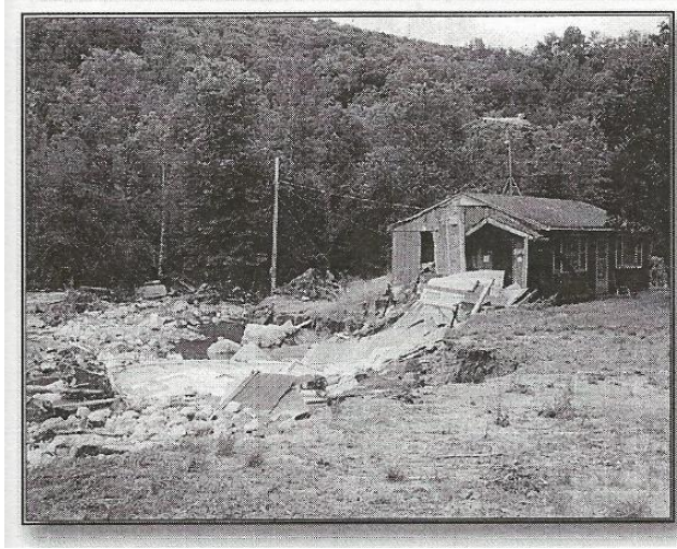
Figure 2. Buildings previously on site were damaged during the 1998 flood.

The town of Bristol acquired the lands of Eagle Park in 2000 during recovery efforts following the flood of July 1998 (Figure 2). Grant funding from the VT Agency of Commerce & Community Development supported site cleanup and buyout of these lands which were subsequently conveyed to the town. A condition of the buyout was that the site remain undeveloped and be incorporated into the Town's park system (Bristol Land Records).