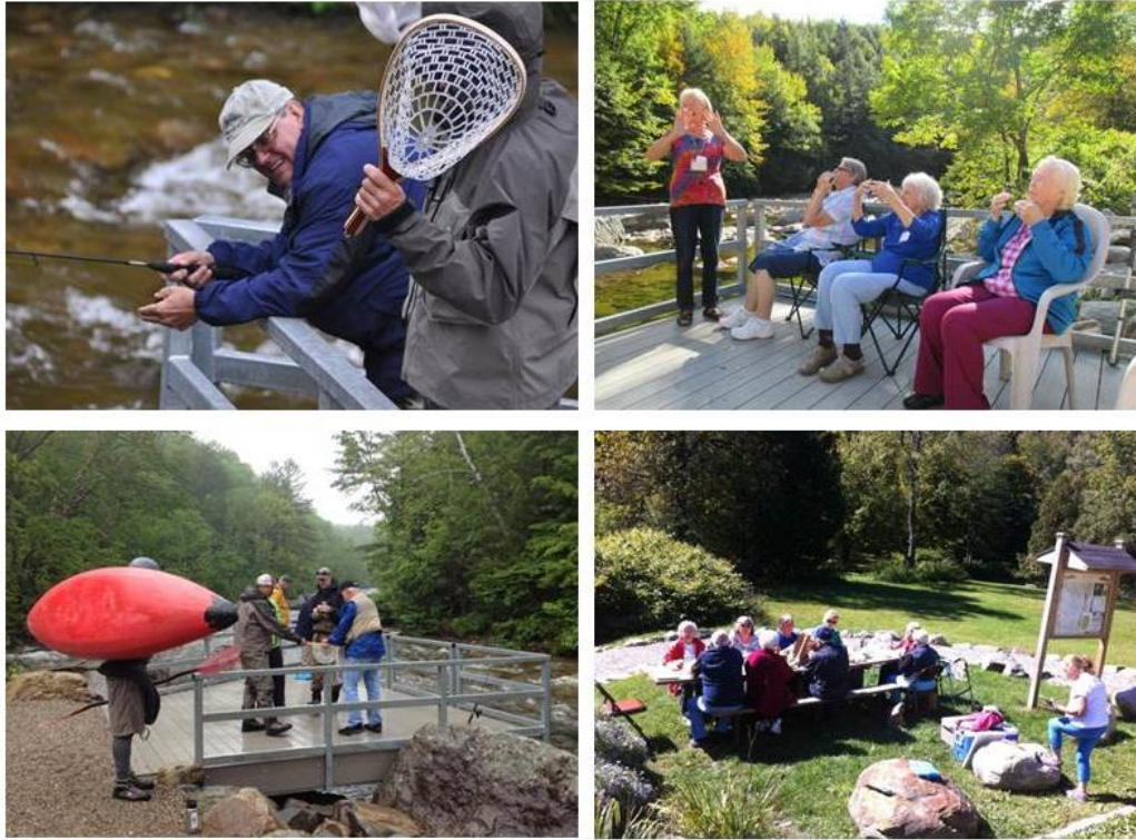
Figure 5. Eagle Park sees regular use by anglers, kayakers, picnickers and fitness classes.