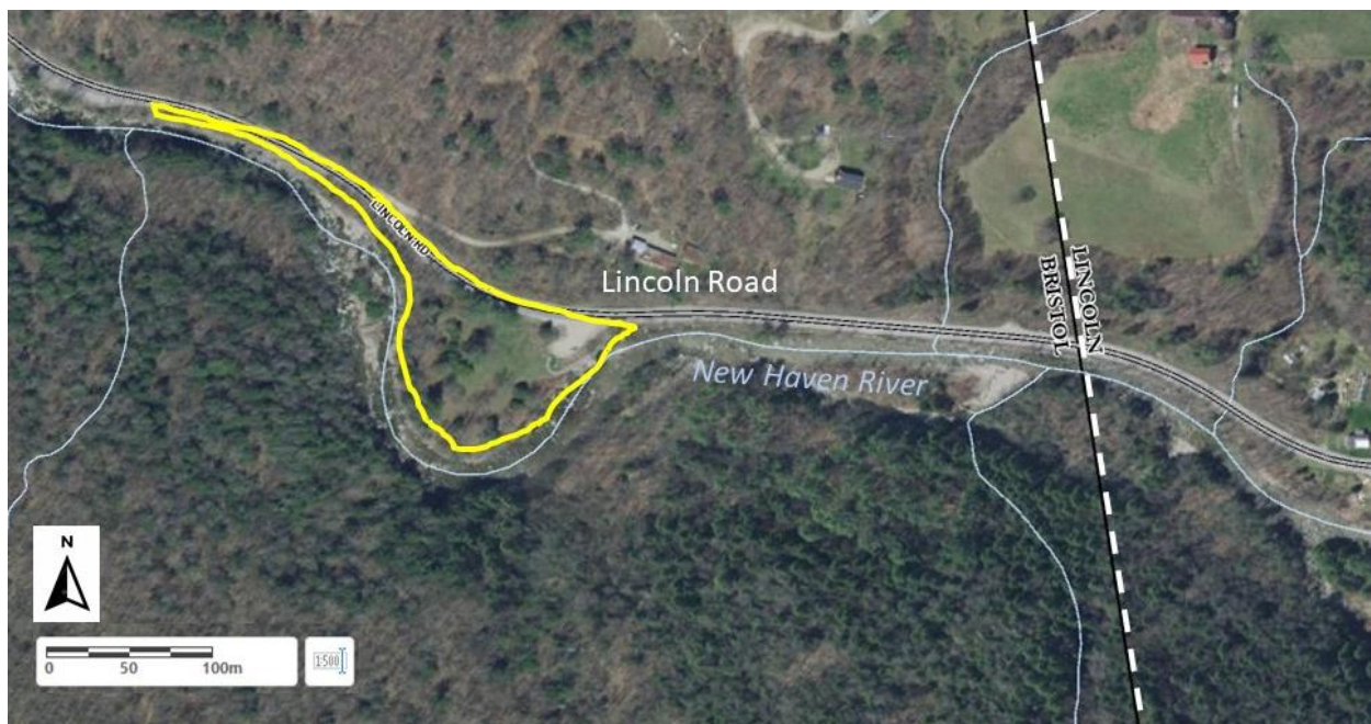
Figure 1. Approximate boundaries of Eagle Park, accessed from a parking area on the south side of Lincoln Road (Property boundaries, approximated from Bristol Tax Parcel Maps, are for planning purposes only and do not represent actual surveyed boundaries).

Eagle Park is a 5.5-acre parcel located at 908 Lincoln Road approximately 0.7 mile east of Bartlett's Falls near the Bristol-Lincoln town line (Figure 1). The park offers a sparsely-forested meadow along the New Haven River for bird-watching, picnicking, and recreating, and features the Chuck Baser Memorial Universal Fishing Platform that provides Americans with Disabilities Act (ADA) compliant access to the river for fishing. The property is owned by the Town of Bristol, and is jointly managed by the Bristol Selectboard, the Recreation Department and the Conservation Commission.