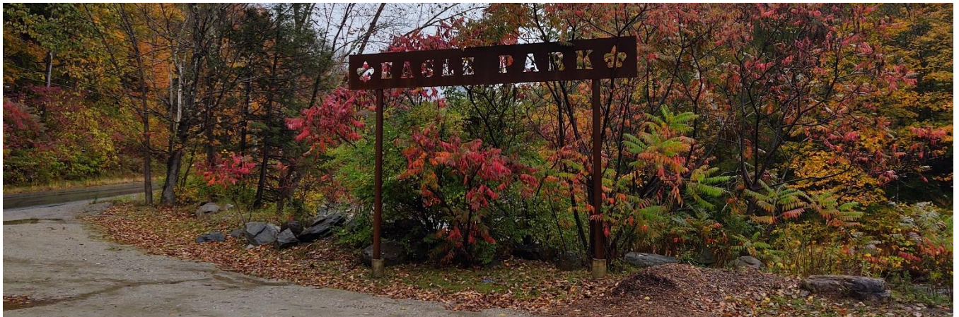
Figure 3. Eagle Park sign

Following acquisition of the parcel in 2000, the town of Bristol maintained Eagle Park as a day-use area with recreational access to the New Haven River. Boulders were installed along the perimeter of the parking area to prevent vehicular access through the park. The grass lawn areas continued to be mowed with access for landscaping equipment permitted through a locked gate along Lincoln Road. A sign for the park was constructed as part of a Boy Scout eagle project (Figure 3).