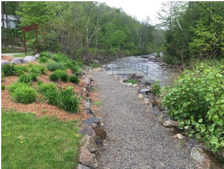
Figure 9. Access ramp leading to the UFP is flanked by a perennial garden on the north and invasive Japanese Knotweed to the south. (Photo dated prior to 2018).

Eagle Park is a day-use site open from dawn to dusk. No public access is allowed between dusk and dawn, except for specific activities granted prior approval by the Selectboard. Motorized vehicles are not permitted at the park. Visitors may enjoy swimming or wading in the river, however no life guard is available. Trespassers between dusk and dawn will be handled according to the Town’s Trespass Ordinance.