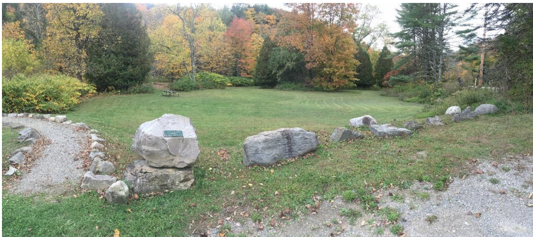
Figure 4. Maintained meadow just south of the Eagle Park gravel parking lot; entry to ADA-compliant gravel-packed access path to Universal Fishing Platform.

Tree species include Eastern Hemlock, White Pine, Ash, Yellow and White Birch, Sugar Maple and Red Maple.