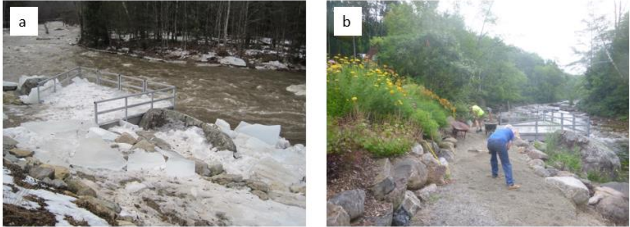
Figure 6. Universal Fishing Platform (a) receives ice during thaw event on January 30, 2013. (b) Bristol CC members replace gravel on access ramp to the platform during an August repair activity following flooding on July 1, 2017 that eroded a segment of the walkway.

Two past flood events were sufficiently impactful to result in more substantial damages. Both floods were federally-declared disaster events. The first occurred in 2011 on August 28 during Tropical Storm Irene – a flood with an annual exceedance probability of approximately 3% in the New Haven River watershed (Olson, 2014). The gravel-packed access ramp was washed out, and expenses to restore the ramp were reimbursed, in part, through federal and state grants. The second substantial flood event occurred on November 1, 2019. Heavy rains following a wet October, generated peak flows on the New Haven River with an annual exceedance probability of 1 to 2% (Olson, 2014). Post-event site inspections and survey indicated that floodwaters rose to approximately 1 foot over the top surface of the platform, and the upstream anchoring boulder moved (SLR Corp presentation to Selectboard, 9/27/21). Brackets attaching the platform were separated from the boulder, putting the platform out of level. The concrete ramp was undermined and cracked.